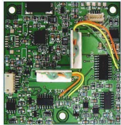
*Shown with two SH Series Ceramic Sensors installed (not included).